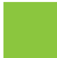
Message2U Green Pantone© 376C